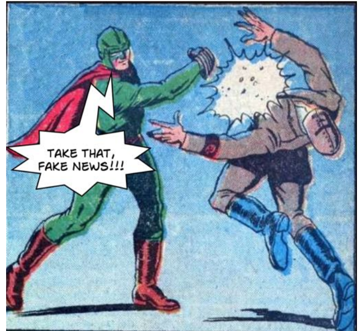
Official White House rendering of Donald J. Trump in action.

Trump’s actions have been wildly applauded by the majority party in Congress and by 42 percent of the American public, as polled by the official White House news service, Breitbart.