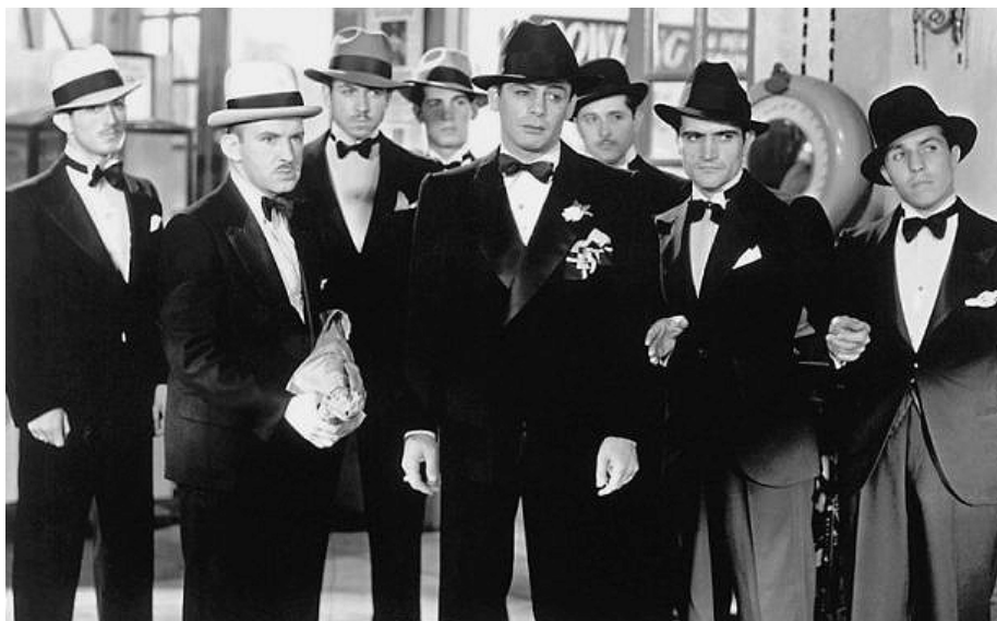
CBS Board fashion show—just before police were called.