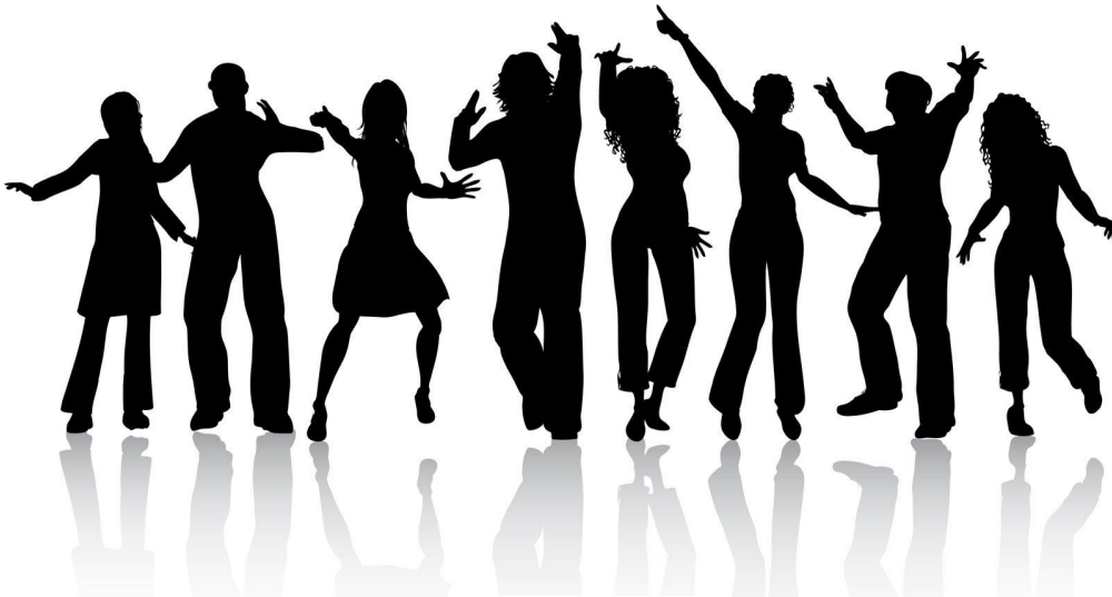
CBS Board members celebrate after voting in Teaneck, NJ