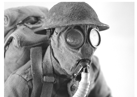
O'Reilly at Battle of Belleau Wood

Bill O'Reilly, saying that he is putting his reputation on the line merely by joining the CBS Board, vows to lead insurgents in reorganizing the group, and that he is the man to head it.